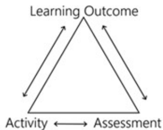
Figure 1: Constructive alignment

“[Constructive alignment] makes quite explicit the standards needed if the intended learning outcomes are to be achieved and maintained” (Biggs & Tang, 2015, p. 14).